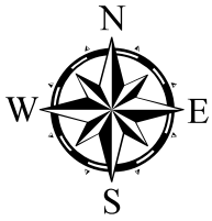
Exhibit B Webb Tract Fluvanna County, VA Tract Area: 76 +/- acres